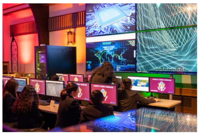
Area middle schoolers take part in educational programs at SAMSAT's security operations center simulator in early 2020. The setting, which is very similar to the configuration of the ARSOC, provides students exciting, hands-on experiences and inspires them to follow educational and career paths as the next generation of cybersecurity talent.

In 2020 the San Antonio City Council approved $2.5 million in funding for construction of the ARSOC, which was supported with an additional $1.5 million in funding from CPS Energy. The Port is providing the facility at no cost for a 15-year term—a value of approximately $3 million.