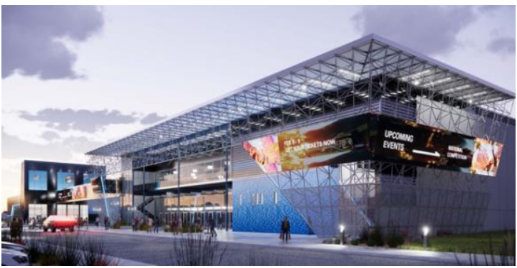
The ARSOC will be located close to the Port's planned Innovation Center — providing City of San Antonio, CPS Energy and other cybersecurity experts a dynamic space to train and demonstrate new technologies that are protecting the region's critical infrastructure.

Once construction is completed in the spring of 2022, the new 130,000-square-foot facility will feature a 3,200-seat arena/conference venue, a publicly accessible industry showroom, and collaborative spaces where different industries can work together in the development of new applied technologies in cybersecurity and other disciplines.