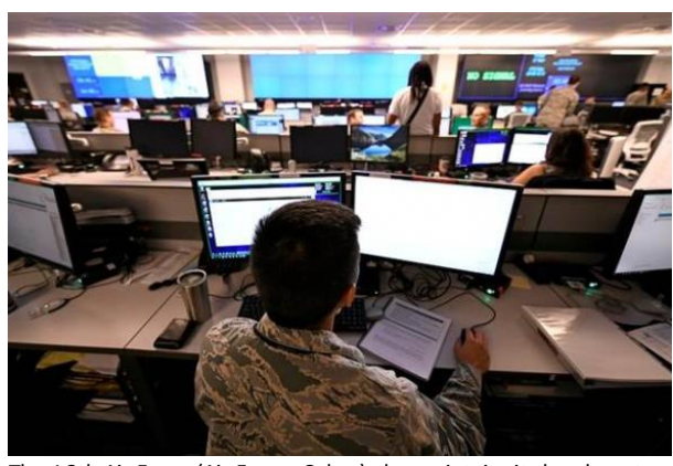
The 16th Air Force (Air Forces Cyber) also maintains its headquarters on the Port campus and neighboring JBSA-Lackland, where its security operations center oversees the integrity of digital assets around the world.

Furthermore, numerous firms at the Port are rapidly expanding as they provide the latest cyber innovations to Department of Defense and an array of other public- and private-sector clients.