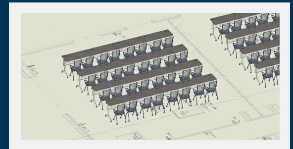
TRAINING ROOMS: SIDE VIEW

The custom designed training facility will feature state of the art retractable screens and individual monitors for each desk station.