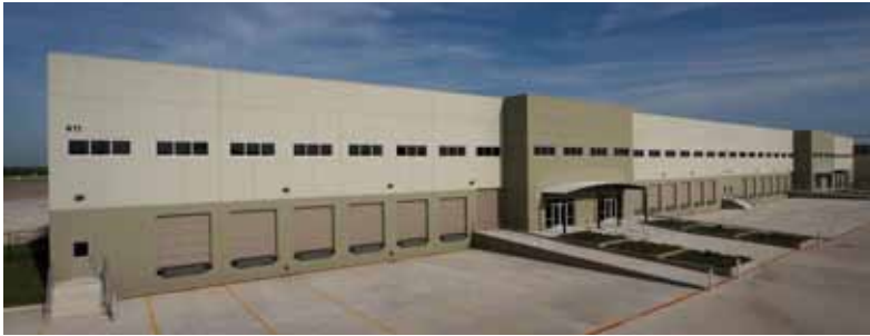
Air Cargo Terminal 1 at Kelly Field

Air Cargo Terminal - Port San Antonio recently completed an 89,600 square-foot (8,300-square-meter) Class A air cargo terminal that is ready for occupancy. The terminal has 14 acres (5.6 hectares) of available ramp space that can accommodate up to four wide body aircraft simultaneously. There is a 50,000 square-foot (4,600 square-meter) cargo staging area on the airside. The terminal also features a 131-foot (39-meter) truck staging area; 50-foot (15-meter) shipping bay; 24 landside dock high doors; 4 ramp doors and security services.