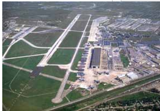
Kelly Field at Port San Antonio.

The 11,500-foot (3,500-meter) runway opened to domestic air cargo planes in 2007. A new air cargo terminal with ample ramp space allows for quick refueling and efficient turnarounds.