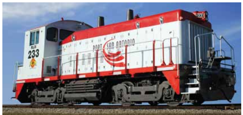
The Railport is on the only southern rail route - called the Sunset Route - that goes from the West Coast and its Asian gateways to the deep water ports of the Gulf of Mexico.

There are 285 acres (115.3 hectares) of rail-served property available, with an additional 65 acres (26.3 hectares) of non-rail served land. This investment grade property can be leased on a long-term basis, for build-to-suit facilities. The entire East Kelly Railport is designated as a Foreign-Trade Zone (#80-10).