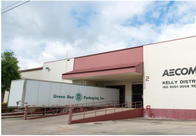
Loading and unloading that keeps items safe from the elements.