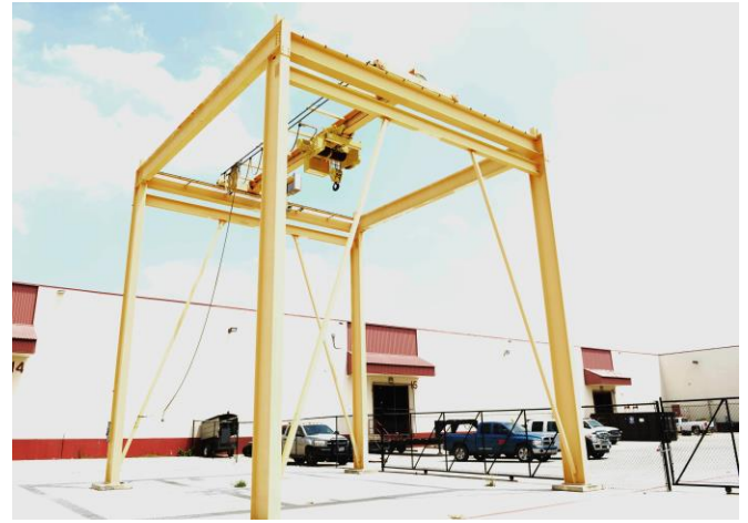
KDC has equipment available and ready to support customers, including a heavy-duty crane used to hoist components such as jet engines.