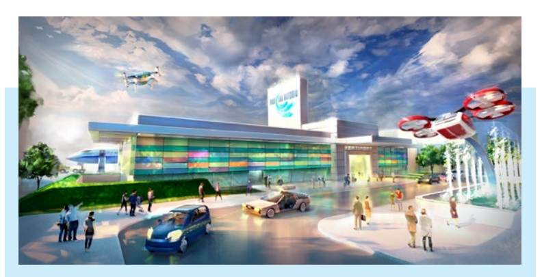
Conceptual rendering of the upcoming vertiport / fixed-base operator at Port San Antonio, able to accommodate traditional winged aircraft and a new generation of passenger electric vertical take-off and landing vehicles (eVOLs).

Conceptual rendering (southward view) of an upcoming multi-story office building near the Port's main entrance at General Hudnell Drive.