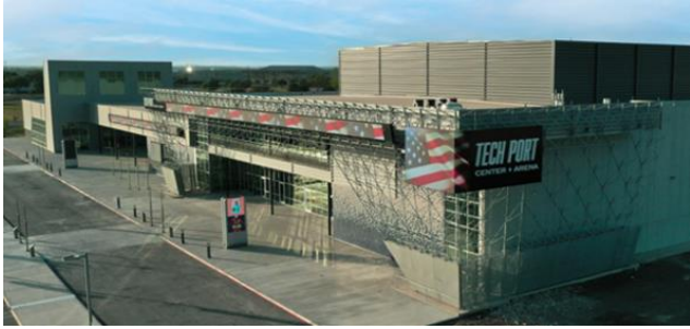
Tech Port Center + Arena as it approached completion in late April. FORCECON will be its first multi-day conference with activations throughout the building.

This year's inaugural FORCECON is a collaboration between the Port, ASM Global, startup accelerator Capital Factory, the University of Texas at San Antonio's Center for Government Contracting (CGC), the Air Force's Air Education and Training Command (AETC), the Air Force Installation and Mission Support Center (AFIMSC), Air Force Gaming, Space Force Gaming, the Air Force's internal innovation accelerator AFWERX and esports firm Rally Cry.