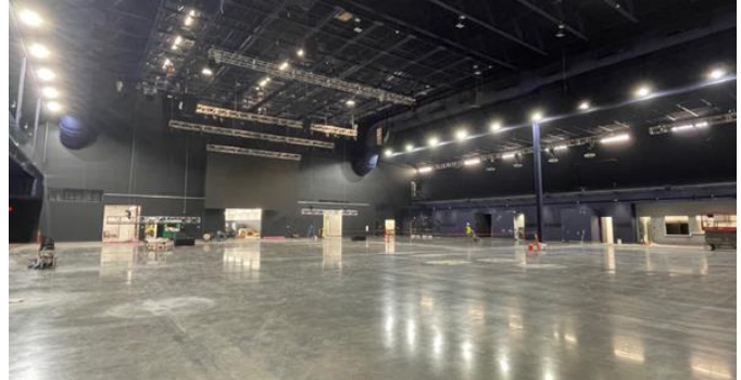
The large arena will serve dual purposes during FORCECON 22. Above: the open floor plan will support the first two days of 'collider' technology demonstration activations. Below: later in the weeklong event, the space will transform into a 3,200-seat venue hosting a concert and esports tournament. (Rendering by RVK Architects)

"FORCECON will put a strong underscore on Tech Port Center + Arena's very special capabilities and value to many different kinds of users — including the government and private sectors, educators, esports enthusiasts and members of the general public — who will be coming together with shared enthusiasm in collaborating, developing and embracing new technologies that support our national defense priorities," he added.