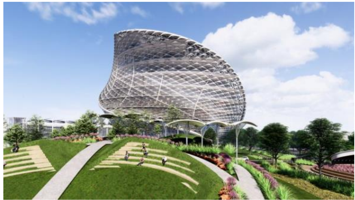
Conceptual rendering of garden exterior of planned tower on the Tech Port campus

completed in the coming months. As it moves forward, the effort will also create opportunities for an array of local businesses. As one of the region's largest and fastest-growing economic engines, representative participation across the community in development projects is a key priority for the organization's Board of Directors and leadership.